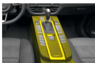
Center Console Covering