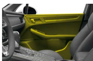
Door Covering Lamination