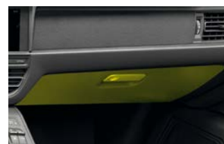
Glove Compartment Door