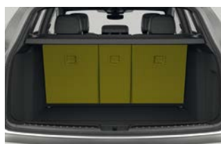
Rear Seat Carpet Covering